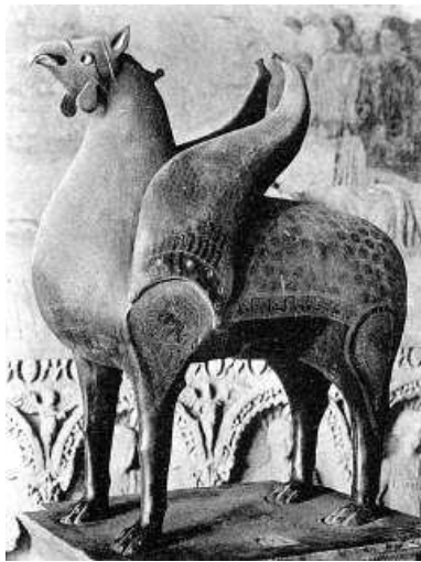
(a) A Hyppogriff

The subfigure package used to cause problems until James Gruetzner and Todd Pitts found out that the subfigure package uses addcontentsline , which is redefined in the SANDreport class. The class uses the ifthen package, but it is not loaded at the time the subfigure package uses addcontentsline . The new code avoids using the ifthen package. Have a look at Figure 2.1 for an example.