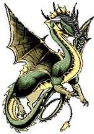
(b) A Dragon