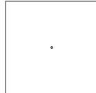
Figure 1.2. A square is another of the basic shapes. It is not quite as powerful as the circle. It has some similarities (note that the four corners all have the same distance to the center), and has many fine uses in everyday dry-erase marker drawing.

Figure 1.2 illustrates another famous shape. We will show some of its uses in later chapters, but we wanted to introduce it here because this is a good place for another figure.