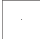
Figure 1.2. A square is another of the basic shapes. It is not quite as powerful as the circle. It has some similarities (note that the four corners all have the same distance to the center), and has many fine uses in everyday dry-erase marker drawing.

Figure 1.2 illustrates another famous shape. We will show some of its uses in later chapters, but we wanted to introduce it here because this is a good place for another figure.